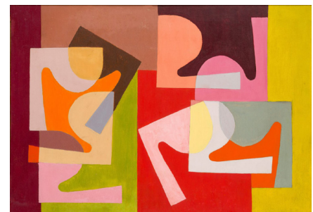
Saloua Raouda Choucair, Fractional Module , 1947-1951, 49.5 x 59 cm, Courtesy Saloua Raouda Choucair Foundation