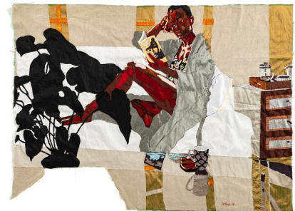
Billie Zangewa, In my Solitude , 2018, 150 x 111 cm, Courtesy Templon, Paris - Bruxelles, © Billie Zangewa. Photo: Jurie Potgieter