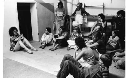
Judy Chicago Visual Archive, Betty Boyd Dettre Library & Research Center, National Museum of Women in the Arts, © Photo: Amy Meadow, © Judy Chicago