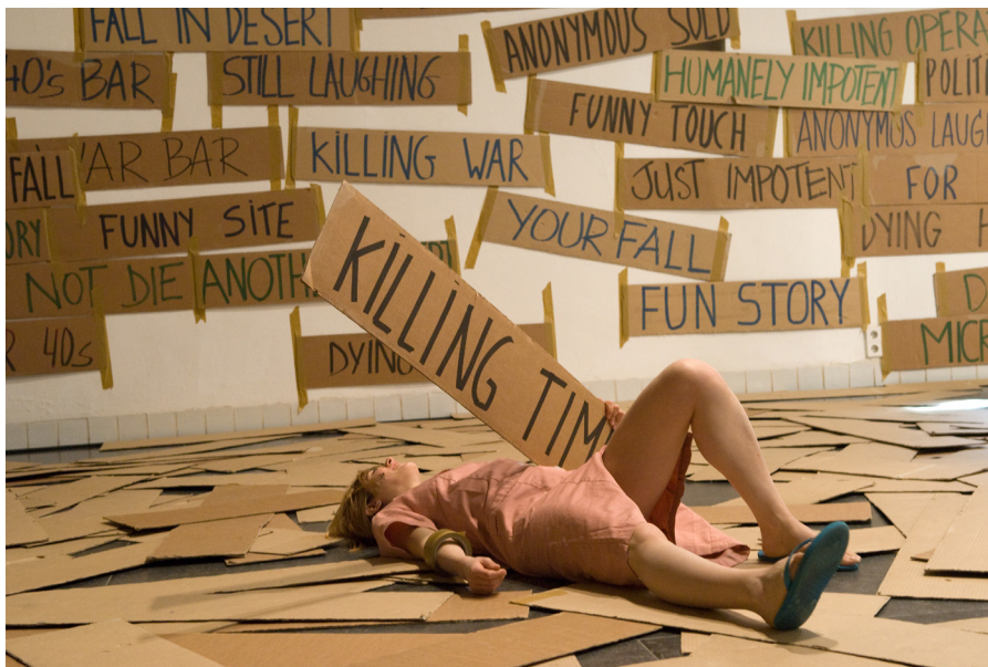
La Ribot, Laughing Hole, installation-performance, 2006, FNAC 2016-0232 collection, Centre national des arts plastiques © La Ribot