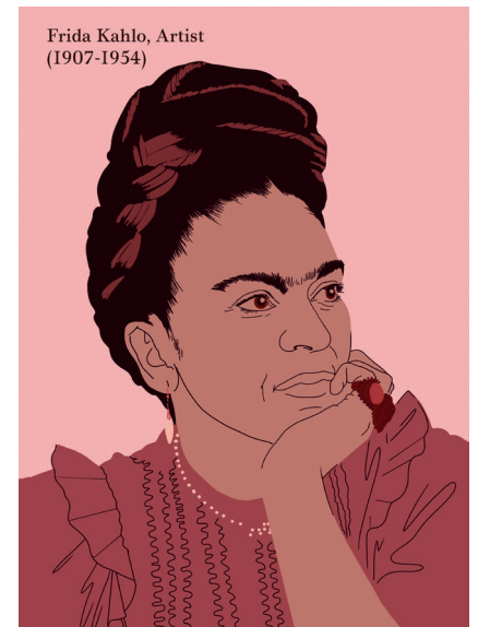
Frida Kahlo, Artist (1907-1954)