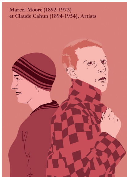
Marcel Moore (1892-1972) et Claude Cahun (1894-1954), Artists

The AWARE project is an integral part of the cultural component of the Generation Equality Forum initiated by UN Women, co-chaired by France and Mexico and held in Paris from 30th June to 2nd July 2021. After a first presentation in Paris at the Bibliothèque nationale de France from 15th June to 4th July, Be AWARE will take up residence in Berlin from 14th July to 19th September 2021 to accompany the Diversity United exhibition dedicated to European artistic creation. It will afterwards move to Moscow at the end of 2021 before returning to Paris in 2022. The Be AWARE exhibition will then travel around France with the support of the Ministry of Equality between Women and Men, Diversity and Equal Opportunities, and will be exported internationally with the support of the French Institute.