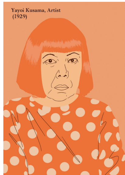
Yayoi Kusama, Artist (1929)